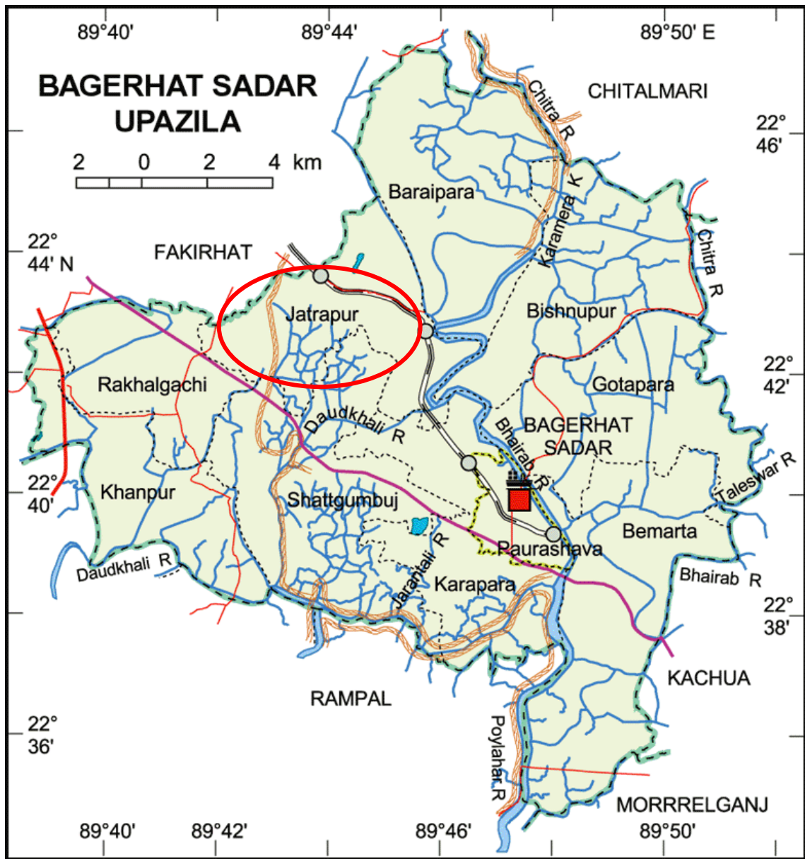
Figure 3.2 Map of Bagerhat Sadar upazilla showing Jatrapur union