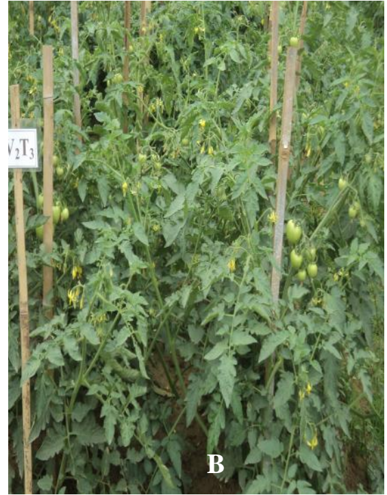
Plate 3. Photograph showing green tomato; A: Ratan and B: Mintoo hybrid