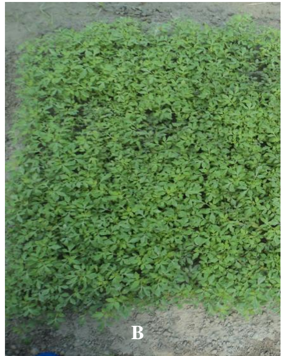
Plate 1. Photograph showing tomato seedlings; A: Ratan and B: Mintoo hybrid