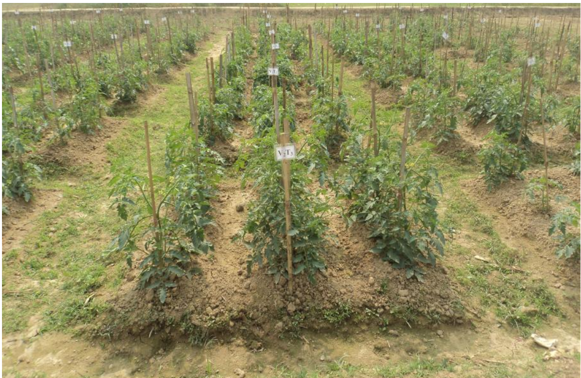
Plate 2. Photograph showing experimental plot