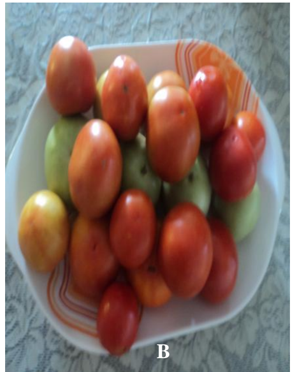
Plate 4. Photograph showing ripen tomato; A: Ratan and B: Mintoo hybrid