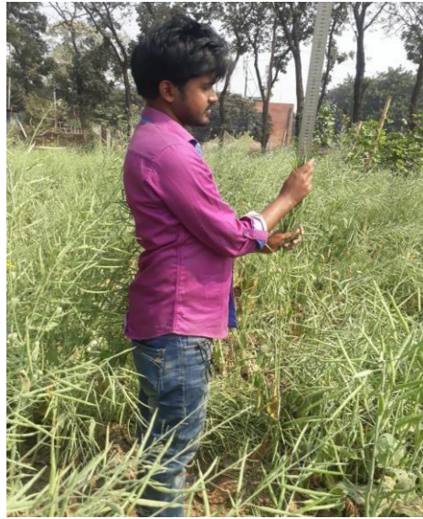
Plate 1: Image of the experimental site.