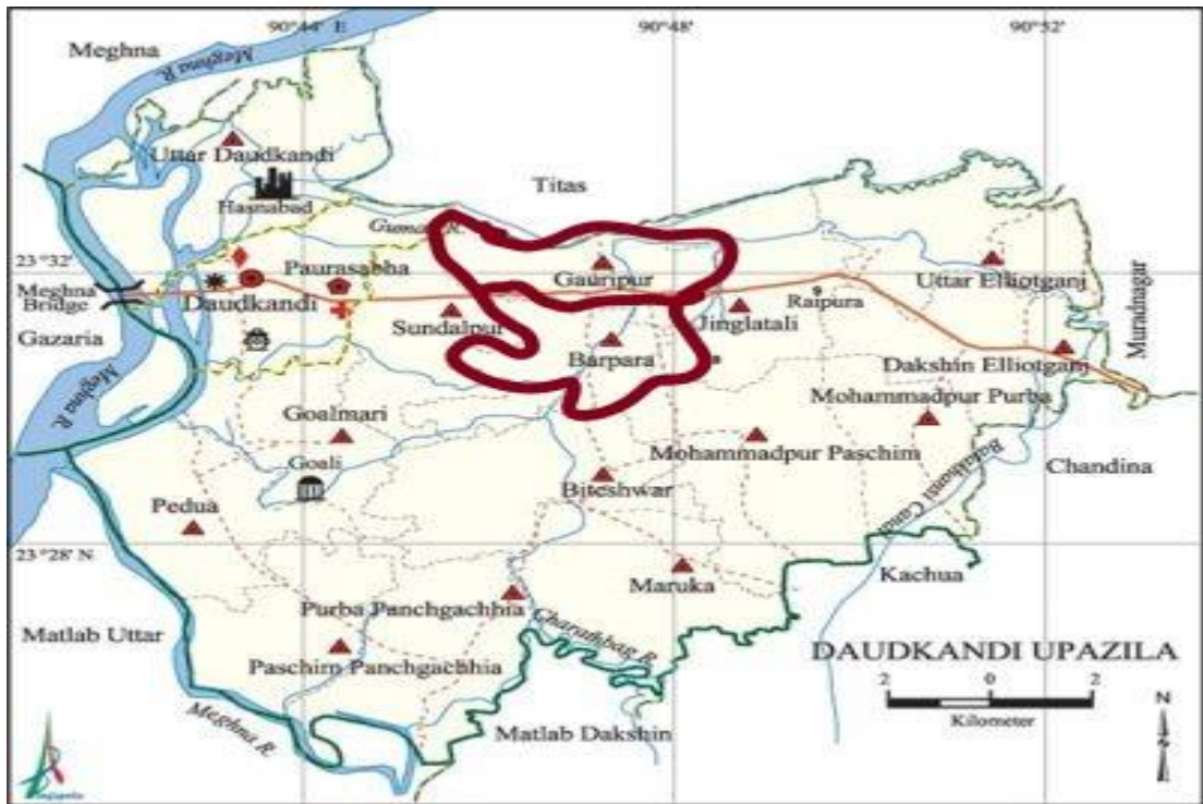
Figure: 3.2 Map of Daudkandi upazilla showing study area