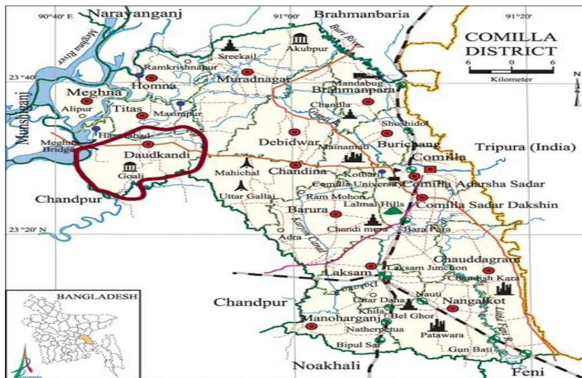
Figure: 3.1 Map of Cumilla district showing Daudkandi upazilla

Cumilla district is selected purposively as it is potential district of Bangladesh for fisheries practices. There are twelve upazillas in Cumilla district, among Daudkandi upazilla were selected purposively. The study was conducted in two unions namely Baro para and Gouripur. These unions were selected purposively because farmers of these areas are comparatively conventional method followers. Prior to selecting these unions, a thorough discussion with the concerned GOs and NGOs personnel and local elites was conducted by the researcher to contact targeted farmers. (Figure 3.1 and 3.2 show the map of the locale of the study).