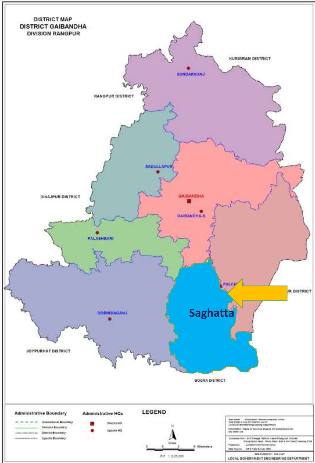
Figure 3.1 Map of Gaibandha district showing Saghatta upazila