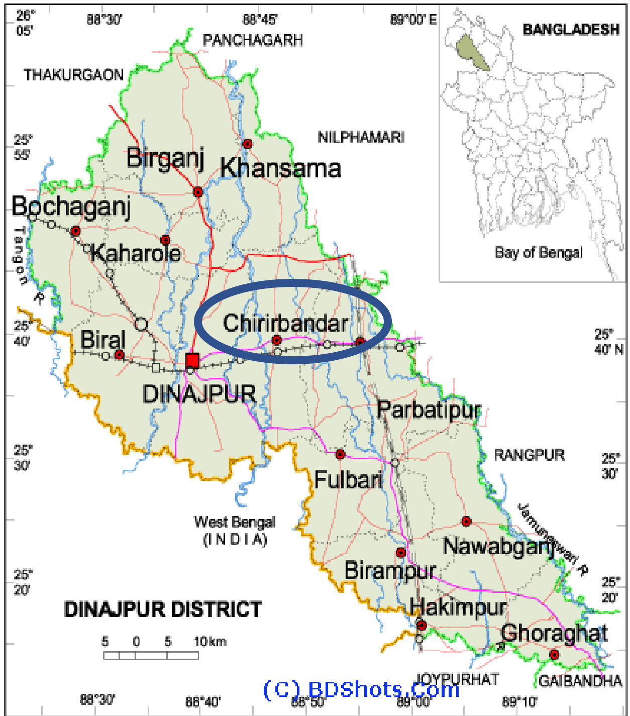
Figure 3.1 Map of Dinajpur district showing Chirirbandar upazila