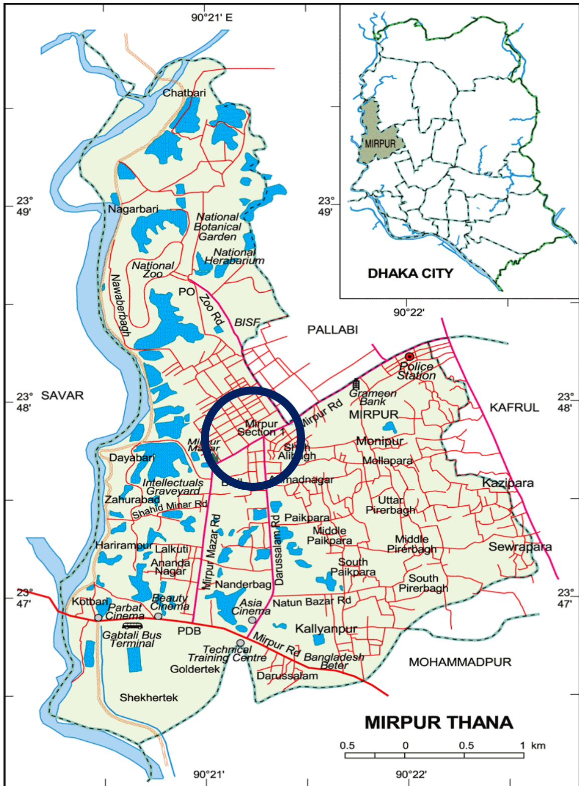
Figure 3.2 Map of Mirpur of Dhaka city showing the study area- Mirpur-1