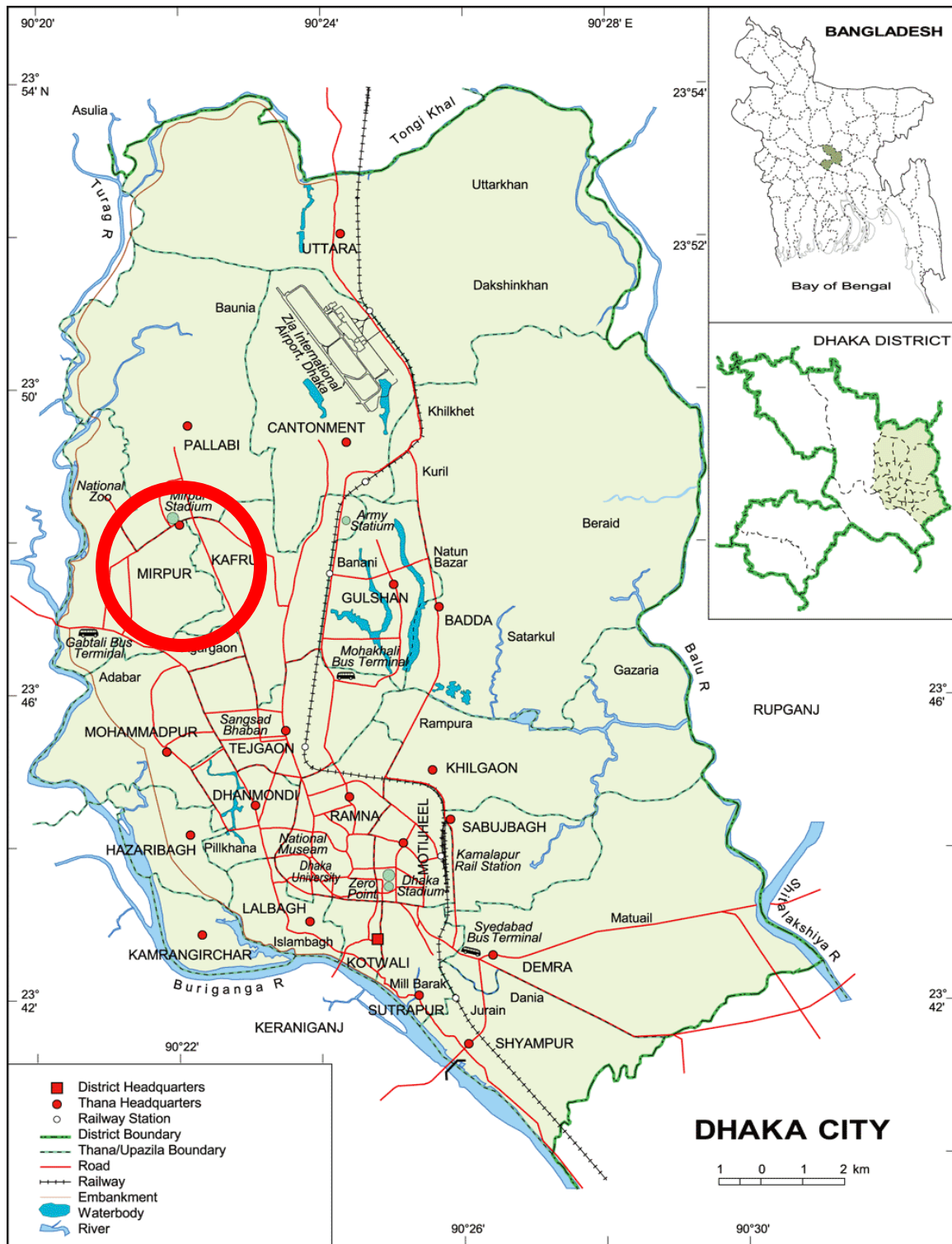
Figure 3.1 Map of Dhaka city showing the study area