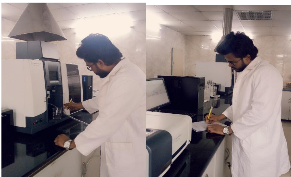
Plate 1. Some photographs shows the experimental works.