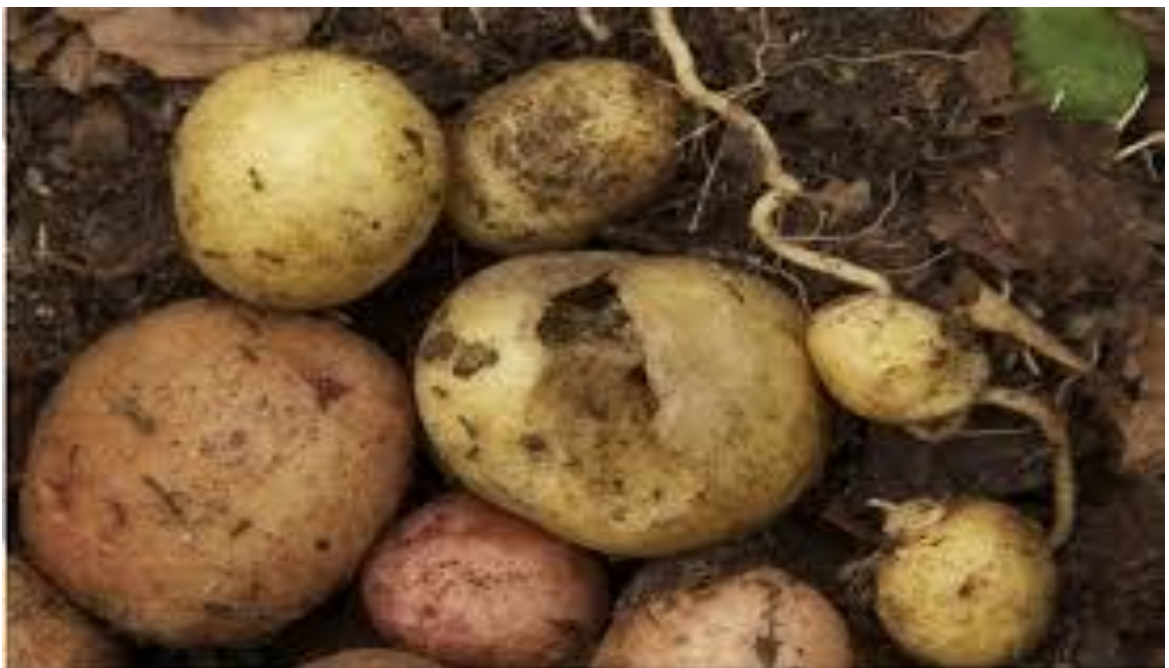
Plate 6. Potato tuber damaged by cut worm