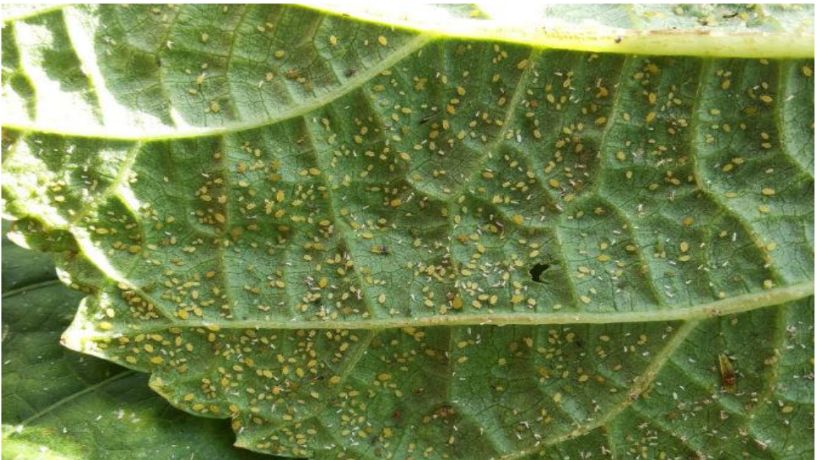
Plate 2. Aphid infested Potato leaf.