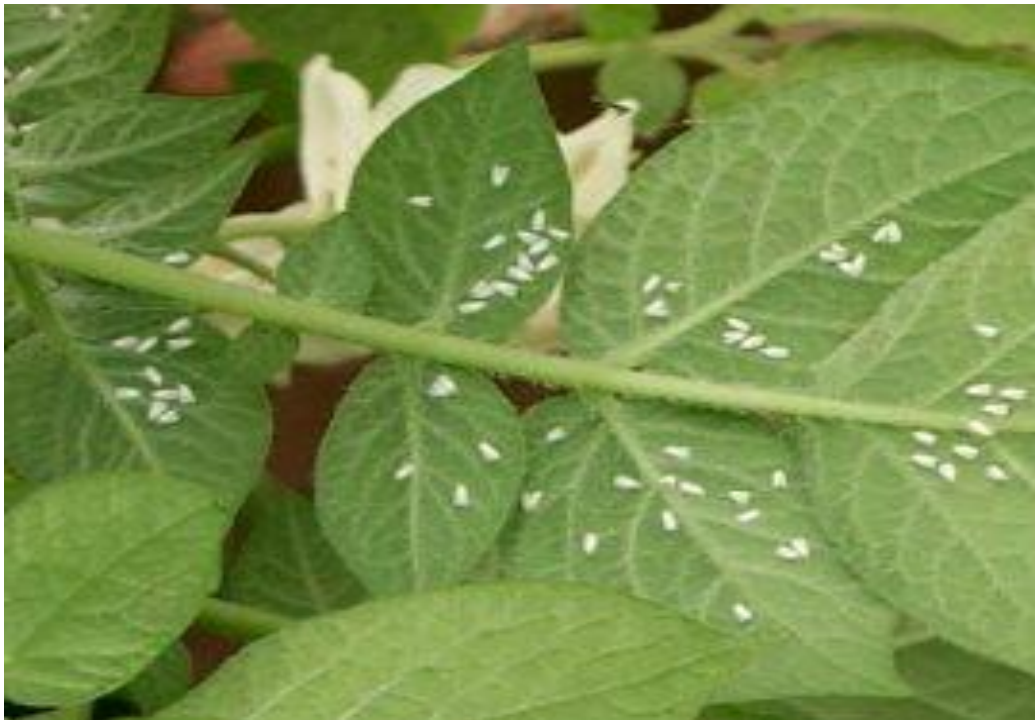
Plate 4. Jassid infested Potato leaf.