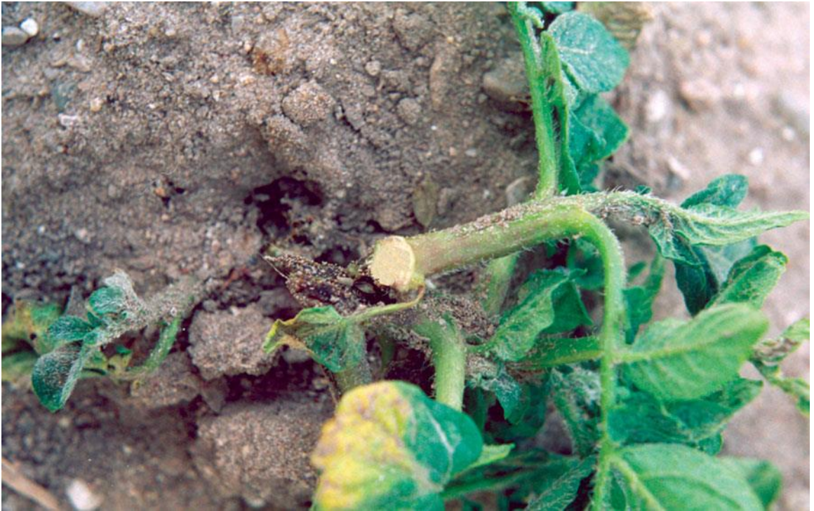
Plate 5. Potato Plant damaged by cut worm.