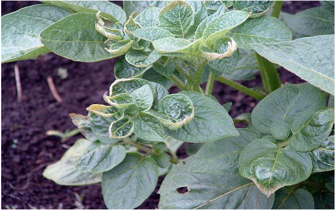
Plate 3. Jassid infested Potato plant.