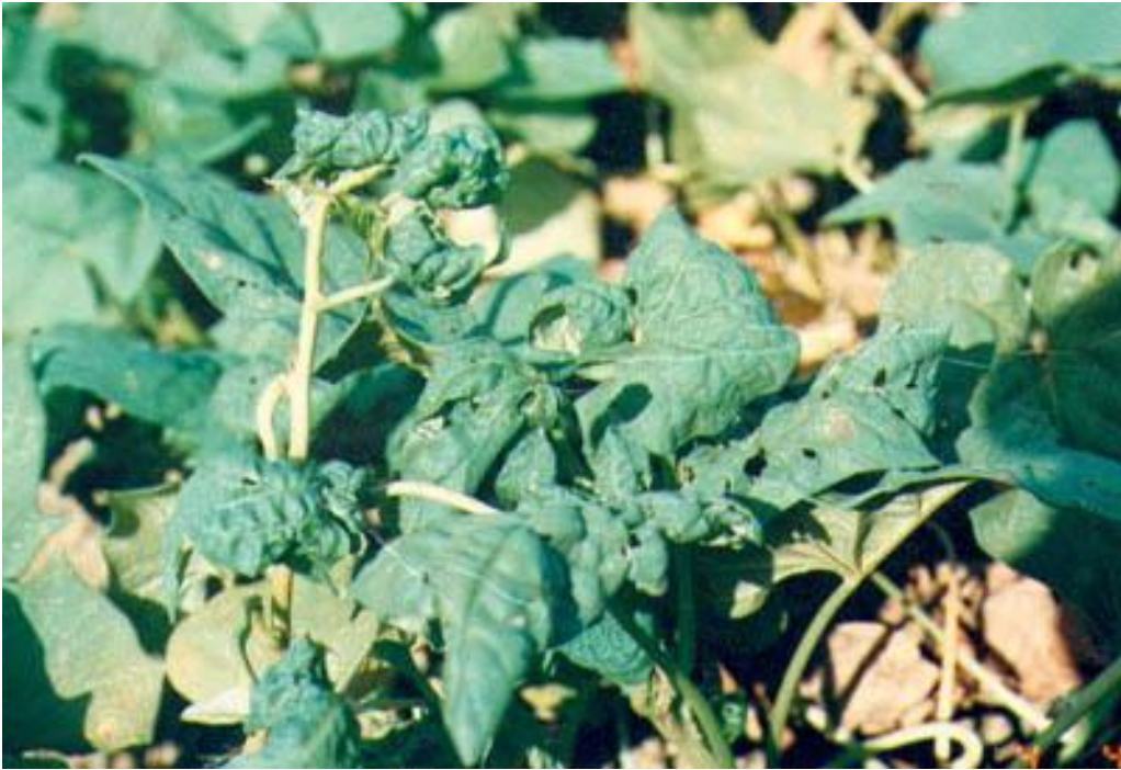
Plate 1. Aphid infested Potato plant.